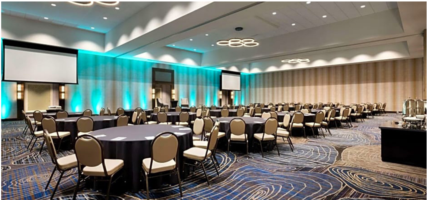
Image: Embassy Suites By Hilton San Antonio Landmark

All cancellations must be made in writing to TGA and received by August 19, 2024 in order to receive a refund. All cancellations will incur a $25 non-refundable processing fee. No refunds will be given for cancellations received after this deadline or for 'no shows.'