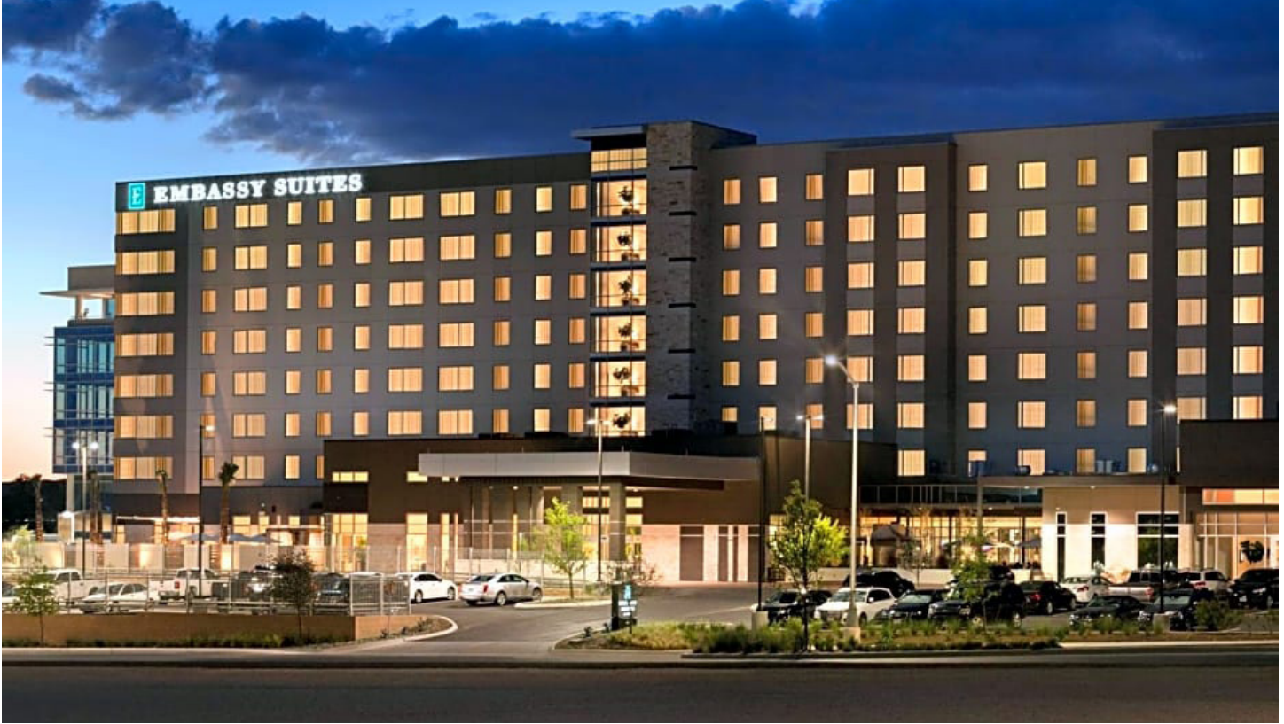
Image: Embassy Suites By Hilton San Antonio Landmark